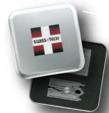
Metal Gift Box