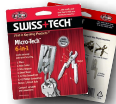
Environmental Clamshell Package